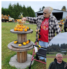
Bailey Family Farms