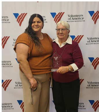
Joyce Clark Membership & Hospitality Award