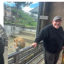
Cougar Mountain Zoo