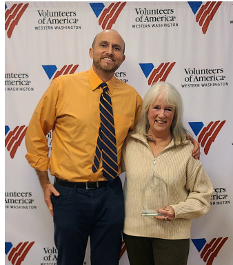
Sharon Wellman Philanthropy Award