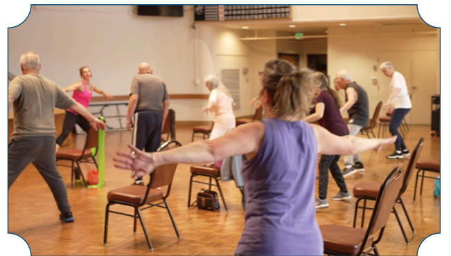
Back exercising just 29 days after brain surgery

And it gives them the opportunity to have friendships and trips and places to go and an affordable lunch, a meal during the middle of the day.”