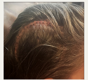
Incision sealed with 24 staples