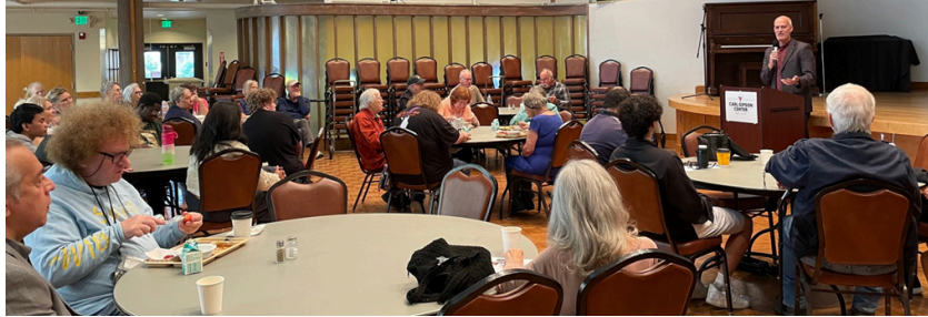
US Representative Rick Larsen speaks on 10/14/24