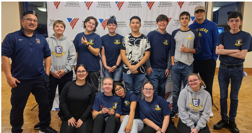
Everett High School's JROTC