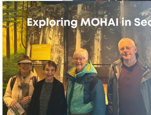
Exploring MOHA in Seattle