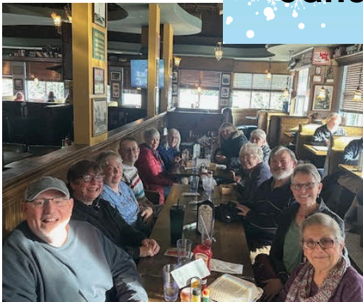
Enjoying Irish fare at Shawn Odonnell's Pub